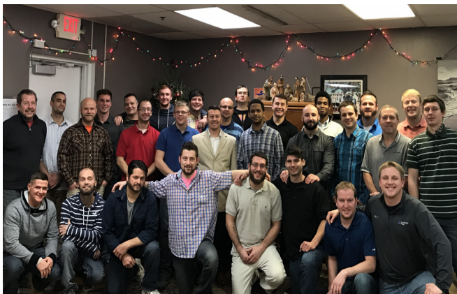
NCITC Christmas Picture

Since being here, I wouldn't trade it for anything in the world. I have witnessed miracles, broken families restored, the blind receiving their sight. The Bible verse I stand on is "Do not gloat over me, my enemies! For though I fall, I will rise again. Though I sit in darkness, the Lord will be my light." Micah 7:8 (NLT)